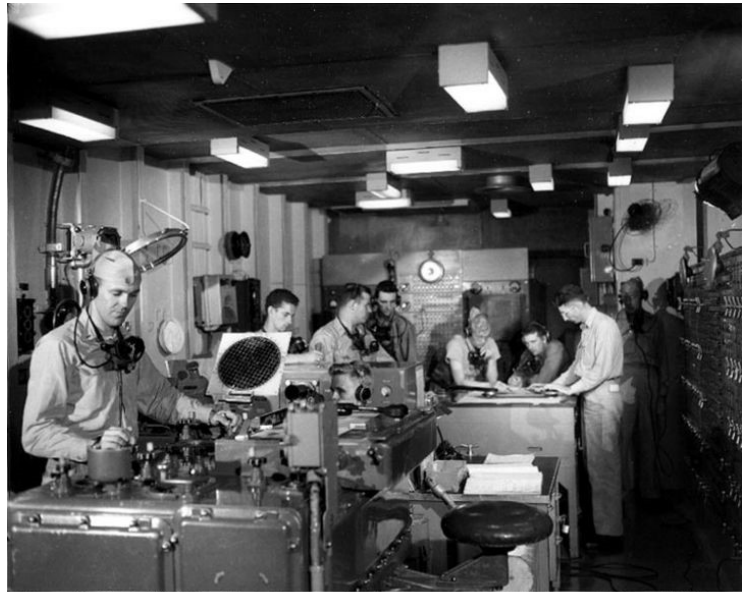
Photo # 80-G-420319 Main battery plotting room on USS Missouri, Sept. 1950

Psychological studies; original HITL meaning: human as component of control system Humans are too variable/adaptable, i.e. they will adapt themselves to compensate for poor system design Humans should be replaced unless more efficient than alternative components and needed as safety monitors Human as component vs. Human as monitor of system